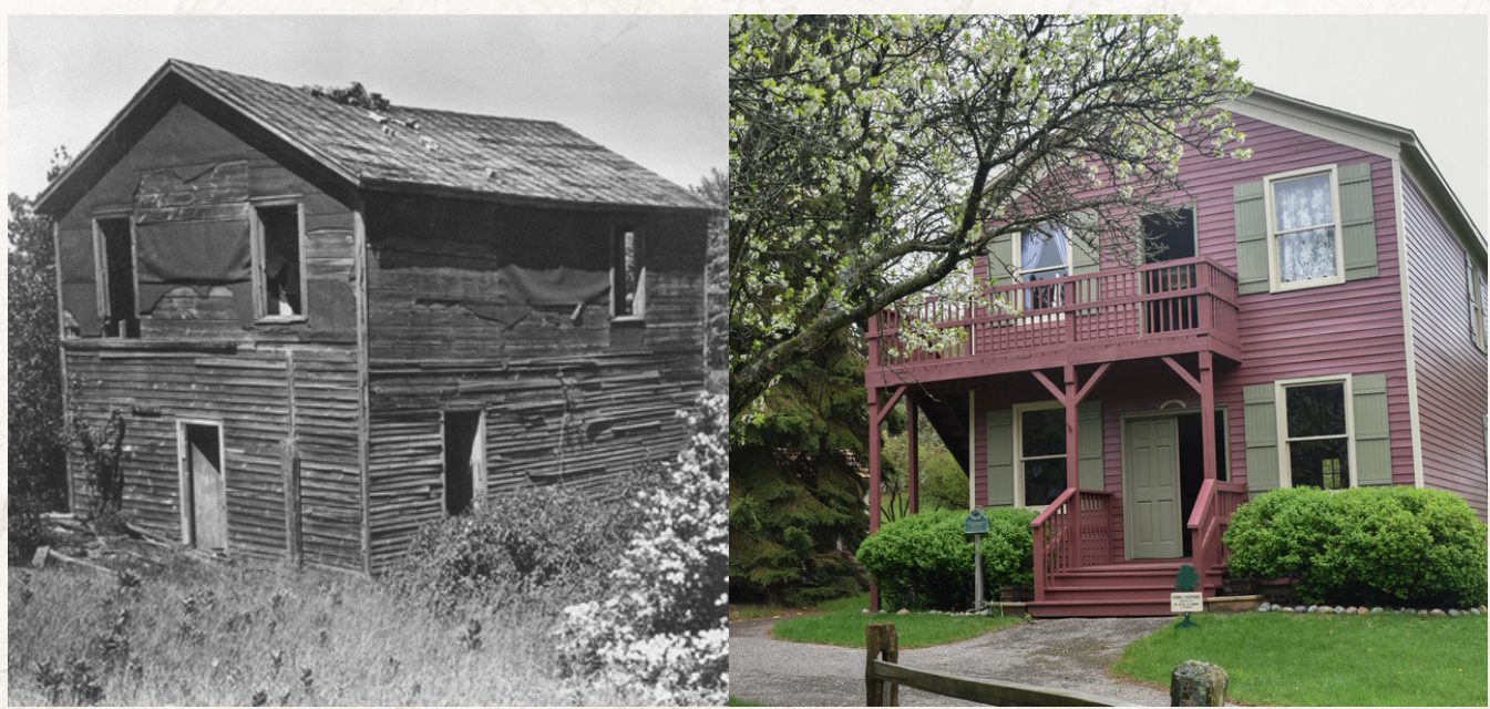
The Caswell Courthouse before and after restoration. Volunteers, and donations helped in the restoration.